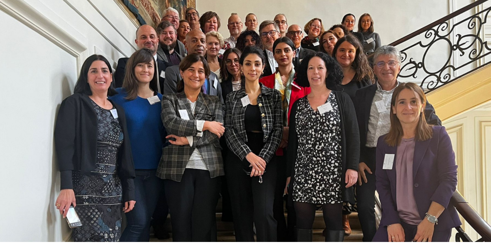
European Restorative Justice Policy Network meeting in Paris, 13 November 2023