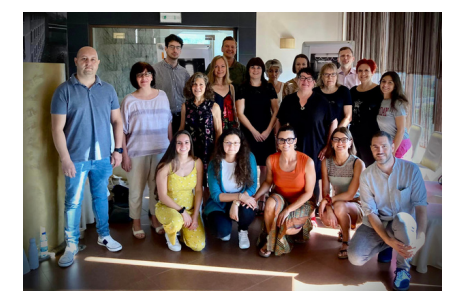
Summer School in Varna & CJPE Summer Course in Barcelona

We also started two online series: the <u>Living Our Values</u> offers an exchange opportunities for restorative justice practitioners, while the workshops of the <u>Bite-Sized Learning</u> address trainers.