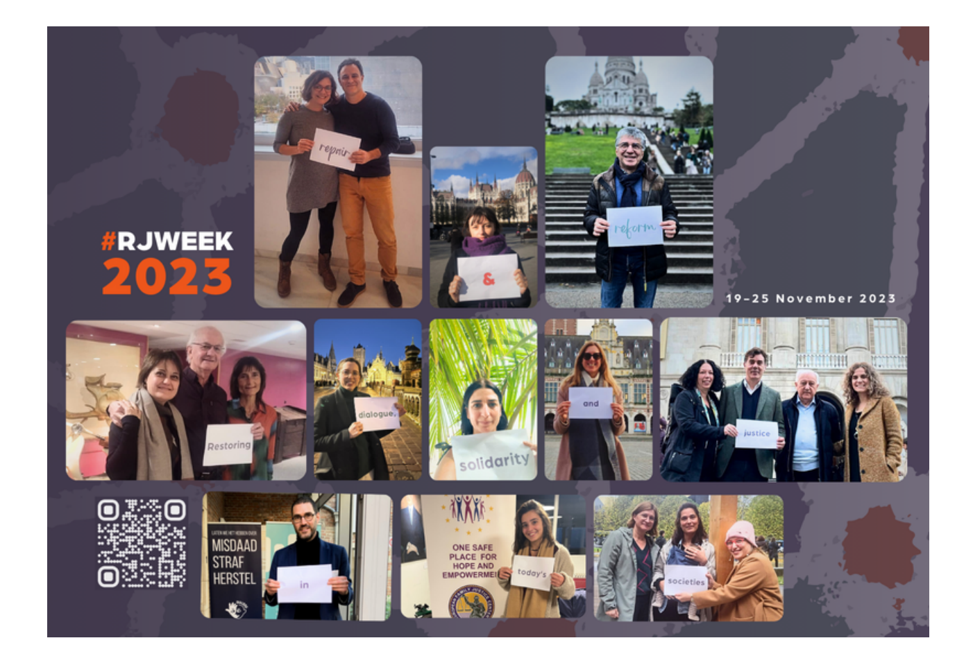
The slogan of the 2023 Restorative Justice Week

The international <u>Restorative Justice Week</u> was a prime moment of the year to celebrate and raise awareness about restorative justice under the theme "Repair and Reform: Restoring Dialogue, Solidarity & Justice in Today's Societies". The EFRJ collected and over 70 events from across the Globe, and we gave visibility to them on our site. The slogan and the campaign materials were translated to several different languages – thanks to your contributions!